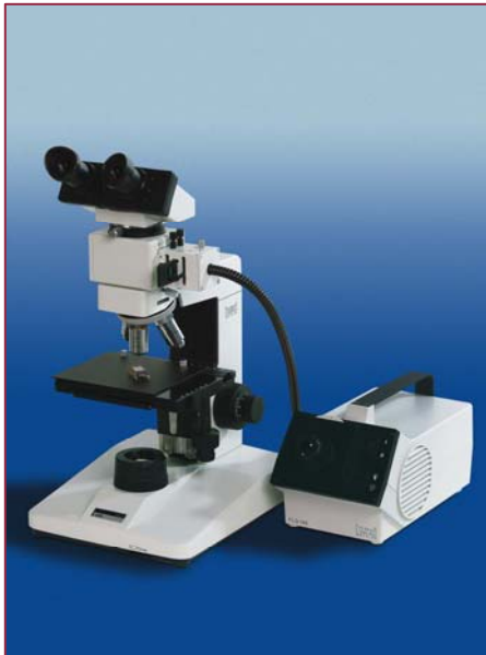
H 600 AM with cold light source