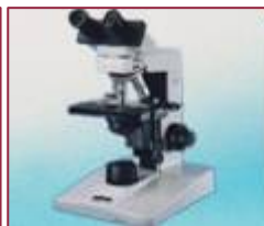
Laboratory & Research H 600 Upright