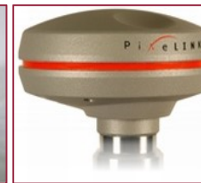
USB-CCD Colour Cameras