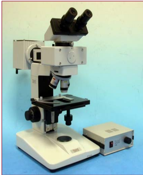
H 600 Fluorescence