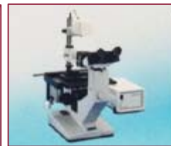
Laboratory & Research Wilovert Inverted